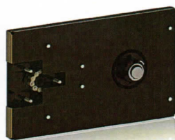
TS 300C cod.1780023 Motor bracket transmission gear ratio 1:6 with cover.