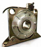
TS 40 cod.1380040 Parachute