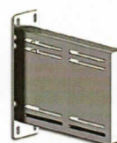
TS-310 cod.1389910 Wall support for bracket transmission gear.